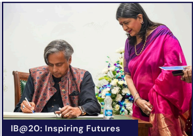
IB@20: Inspiring Futures