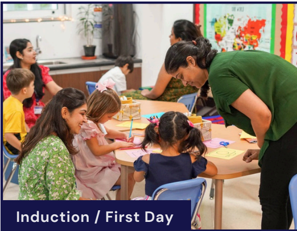
Induction / First Day