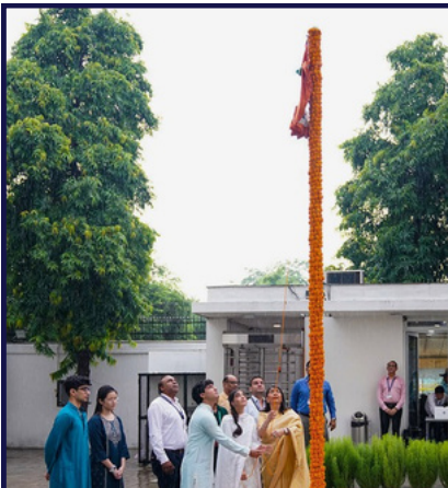
Independence Day Assembly