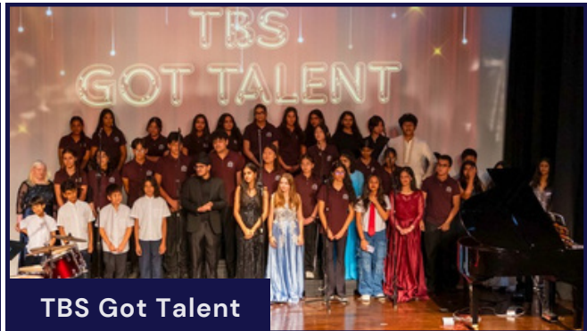
TBS Got Talent