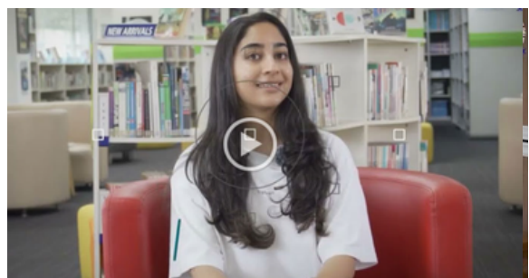
IBDP: Preparing for Life