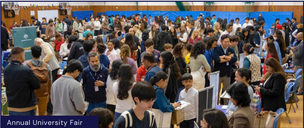
Annual University Fair