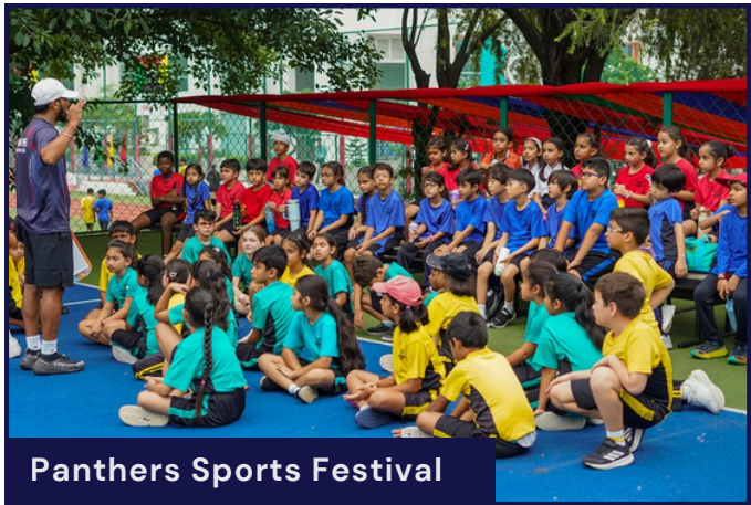
Panthers Sports Festival