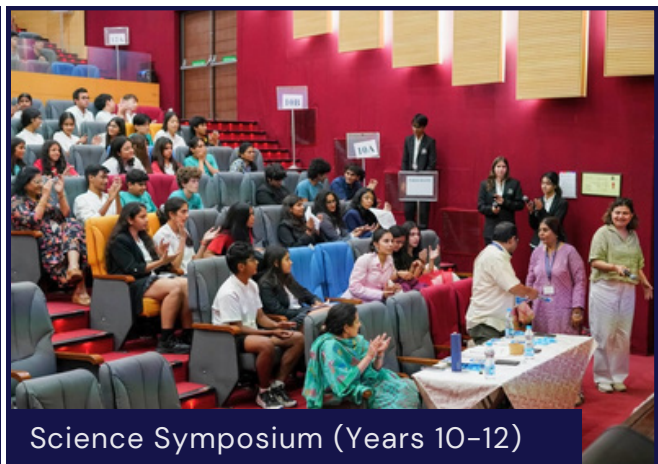
Science Symposium (Years 10-12)