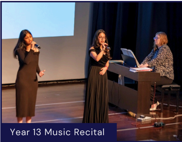
Year 13 Music Recital