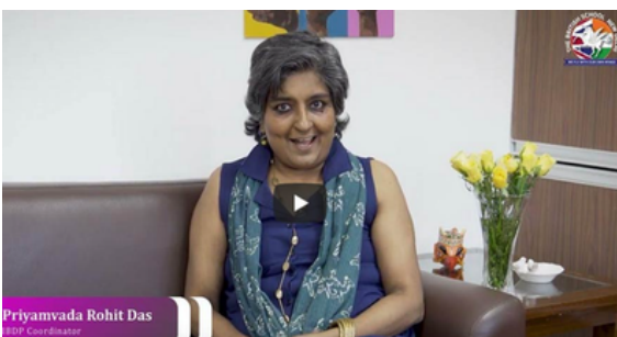
IBDP: Teacher Experiences