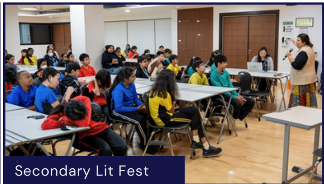
Secondary Lit Fest