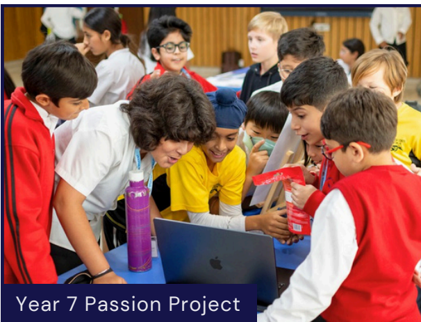
Year 7 Passion Project